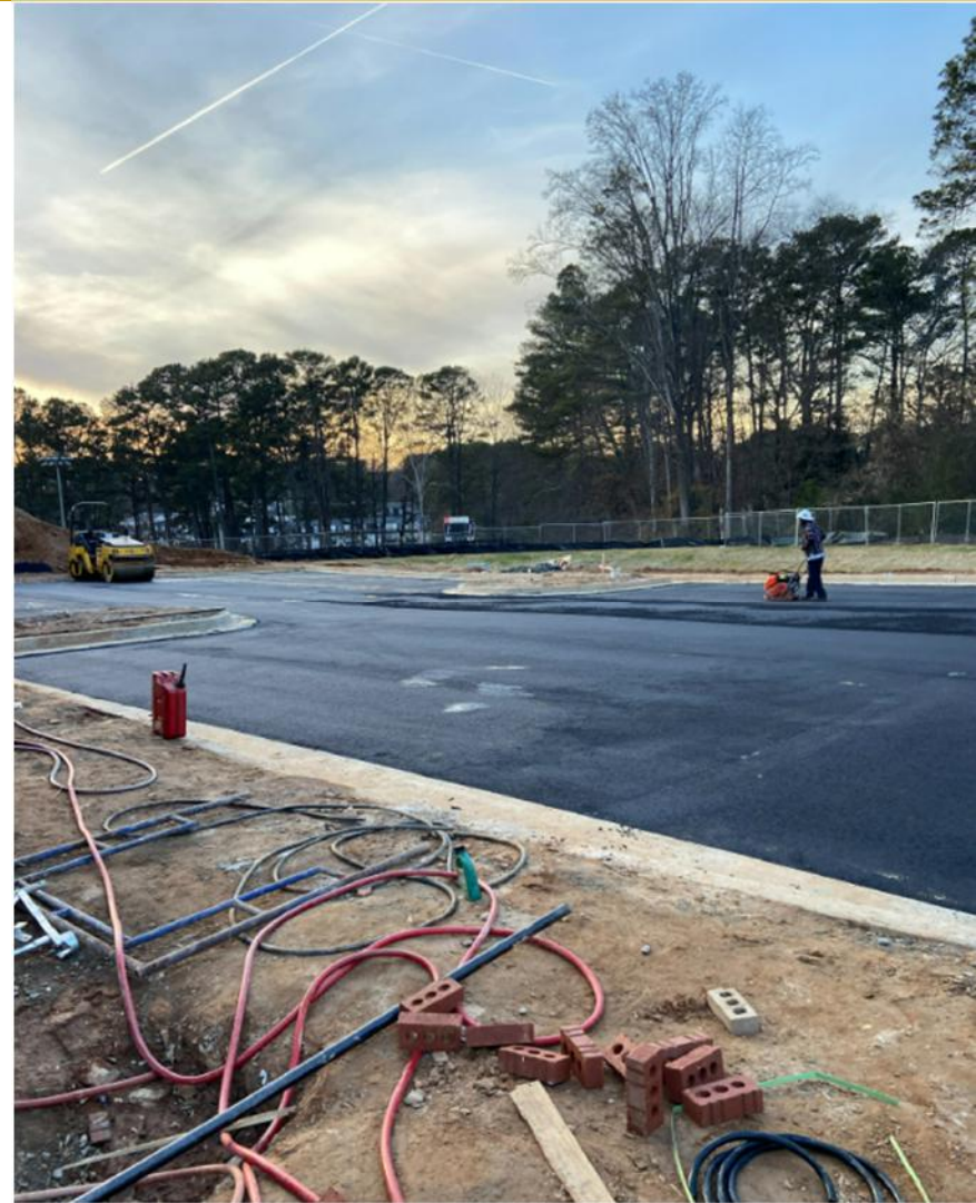
FRONT PARKING LOT